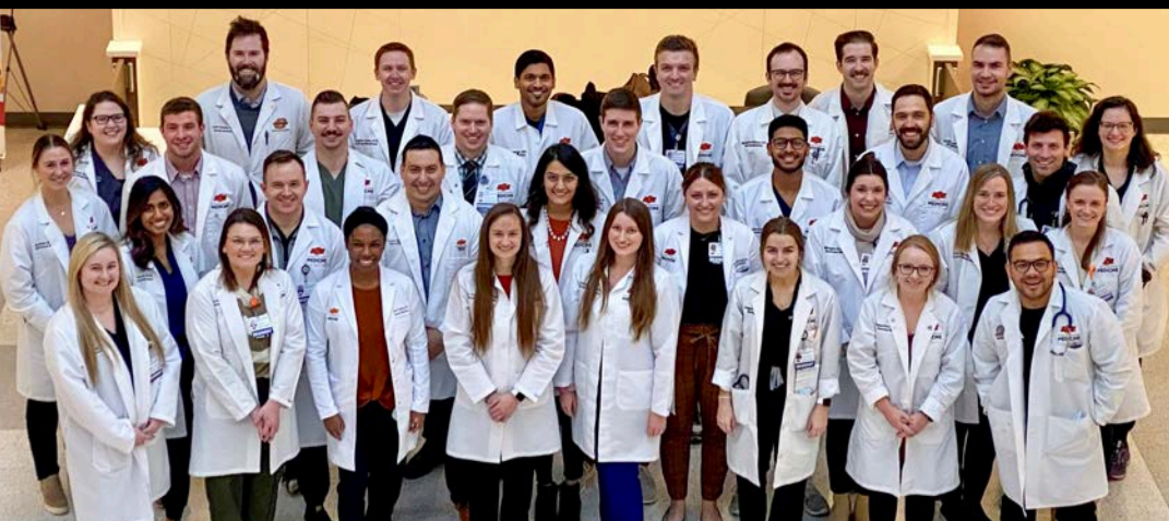
Oklahoma State University Medical Center, Internal Medicine Residents